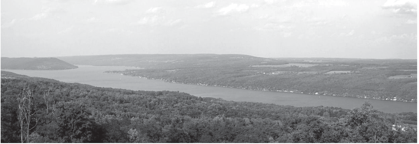
Sample figure 3. Panoramic image of Keuka Lake, New York, viewing toward the northeast. The lake is about 1.2 km wide to right and branches in two major arms toward left. Aug. 2005.